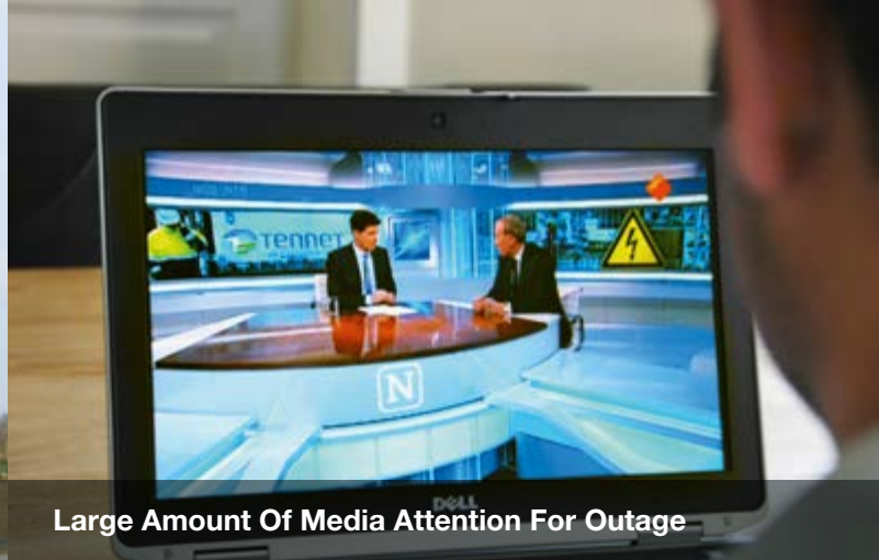
Large Amount Of Media Attention For Outage