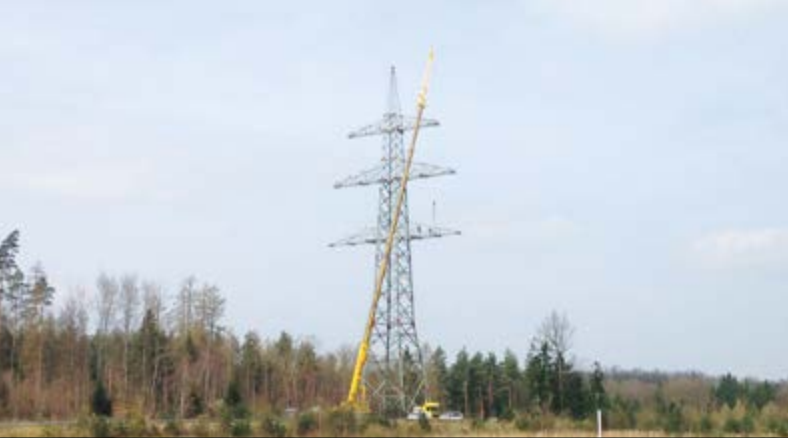
Start Construction Franken Line