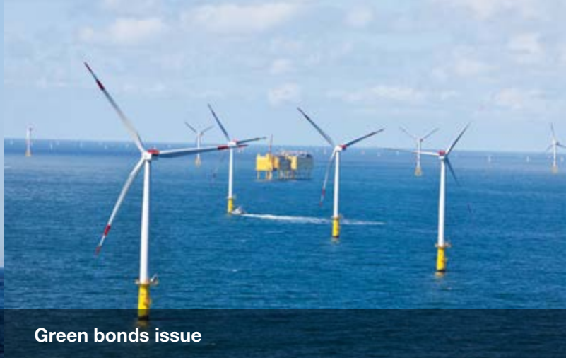
Green bonds issue