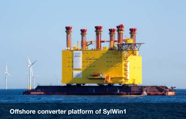
Offshore converter platform of SylWin1